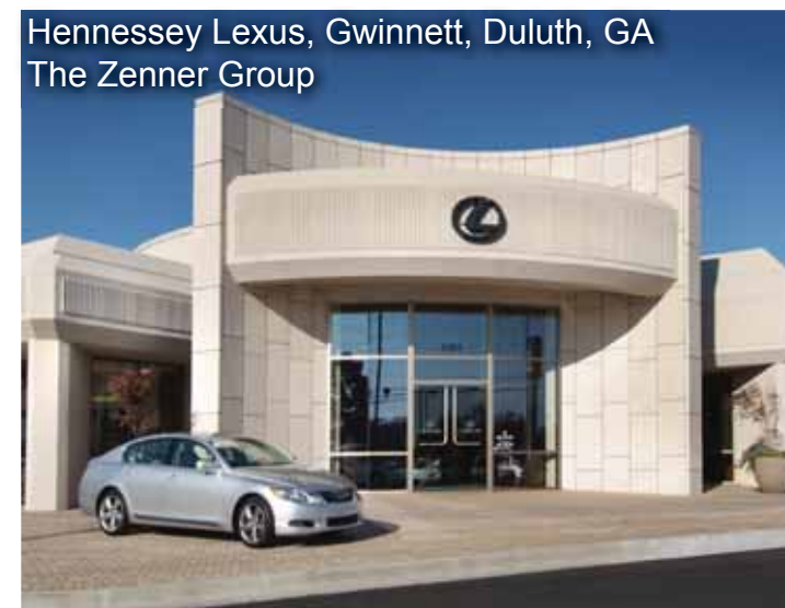
Hennessey Lexus, Gwinnett, Duluth, GA The Zenner Group