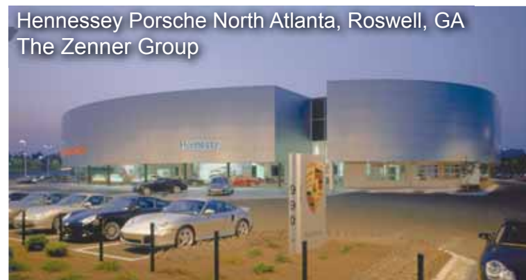
Hennessey Porsche North Atlanta, Roswell, GA The Zenner Group