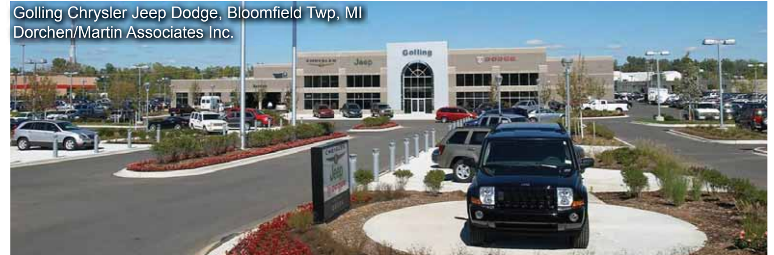
Golling Chrysler Jeep Dodge, Bloomfield Twp, MI Dorchen/Martin Associates Inc.