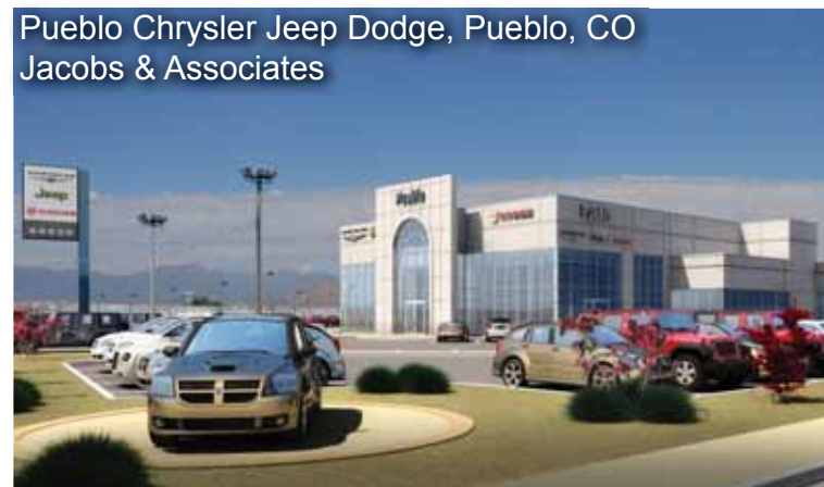
Pueblo Chrysler Jeep Dodge, Pueblo, CO Jacobs & Associates

• Experienced mechanical, electrical and structural ENGINEERS AVAILABLE to collaborate on the design from the earliest possible Phases.