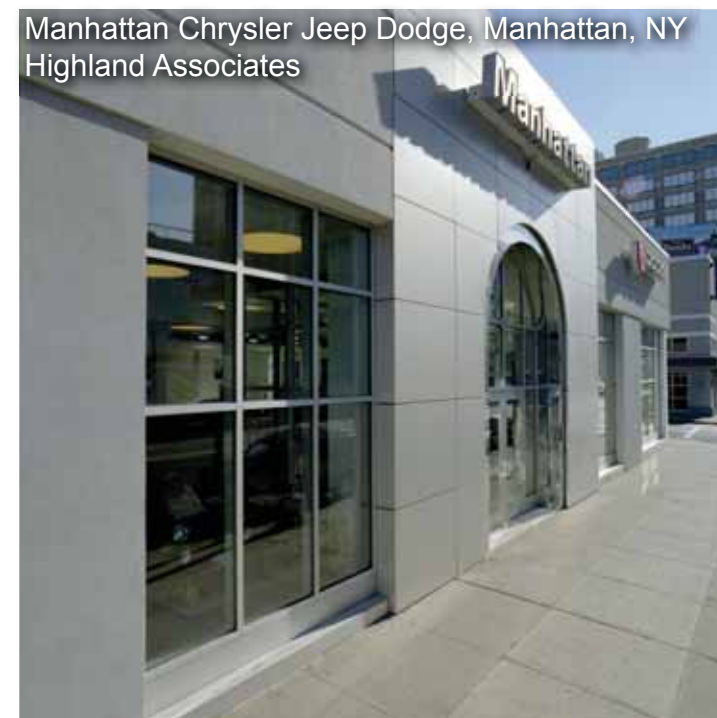
Manhattan Chrysler Jeep Dodge, Manhattan, NY Highland Associates