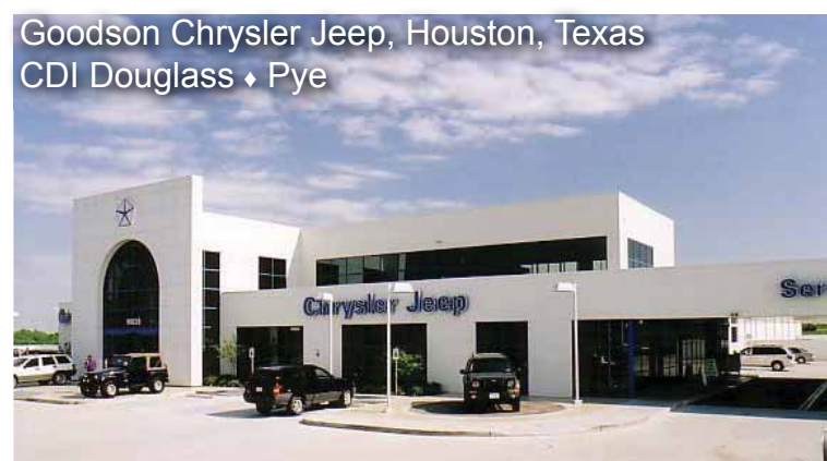
Goodson Chrysler Jeep, Houston, Texas